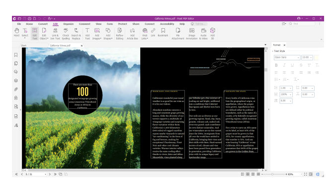
Edit content and layout like a word processor