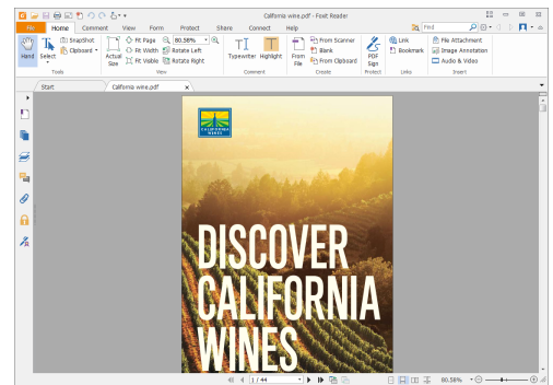
Create PDF with one-click